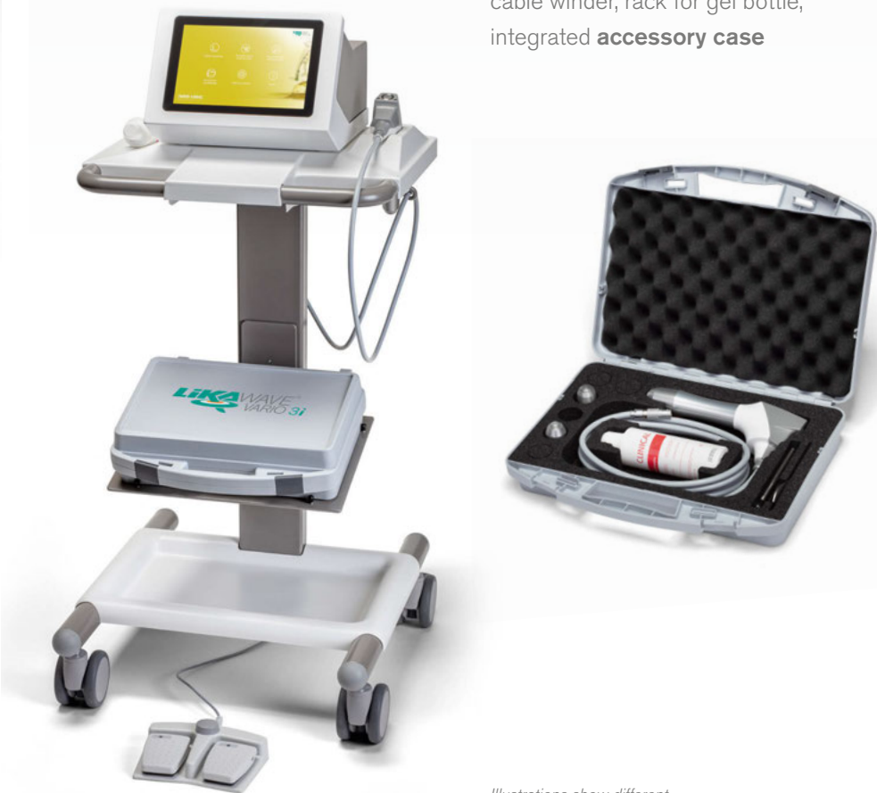
Illustrations show different equipment

Porter with optimal freedom of movement and efficient organisation including bracket for handpiece, cable winder, rack for gel bottle, integrated accessory case