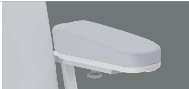
High wedge-shaped foam armrest pads This optional type improves comfort during treatment with a strong inclination downwards.