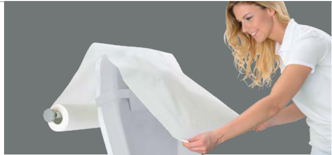
Paper roll holder The permanently installed roll holder keeps the paper roll ready for use and positions the paper cover.