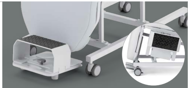
Footrest increase with holder More comfort for smaller patients