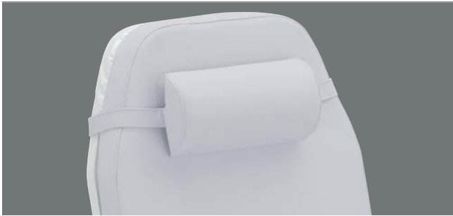
Neck roll for relaxation in the neck region.