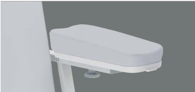
Low wedge-shaped foam armrest pads The ideal option if you want an armrest position with a slight inclination downwards for greater comfort.