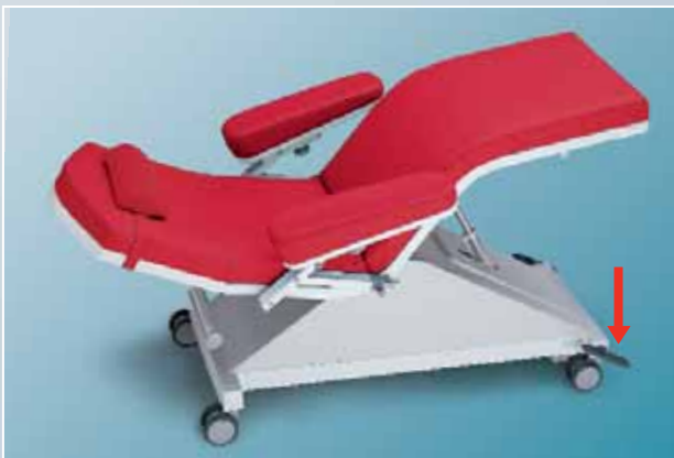
Individual adjustability of the arm rests and central locking (*=option).